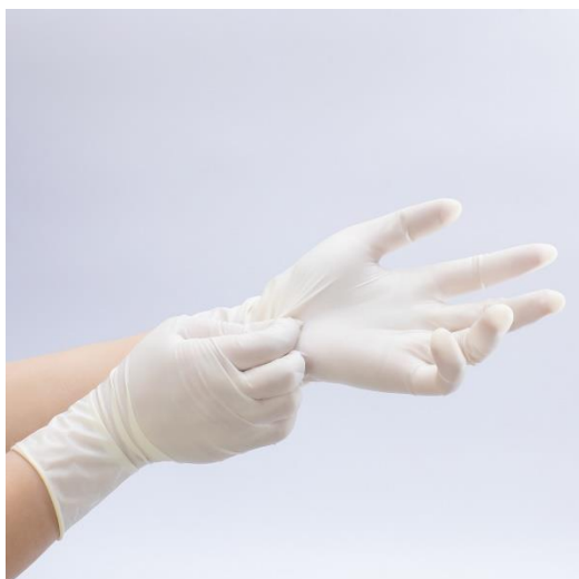
Powder Latex Glove